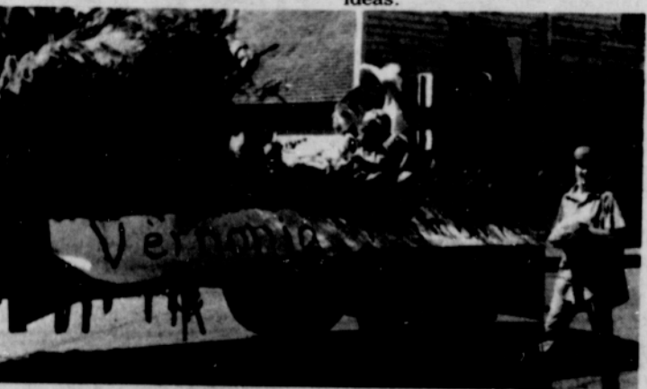
VERNONIA PRIMARIES gets nod for award in parade.

All other open burning remains subject to the existing rules of the Columbia Willamette Air Pollution Authority, Oregon Administrative Rules adopted by the EQC or regulations of