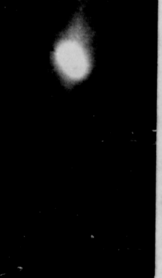
PARTIAL ECLIPSE of the moon happened at midnight last week while the city slept.