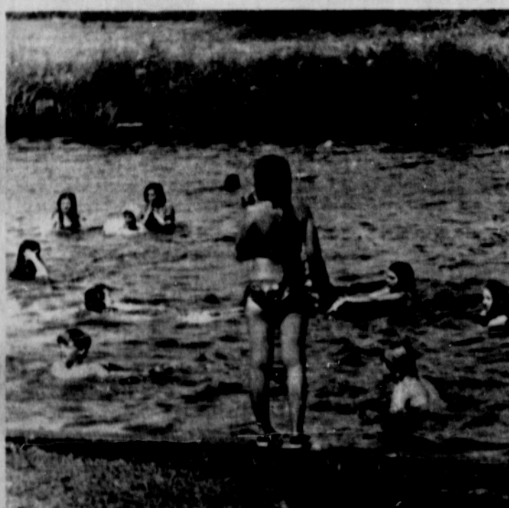
POOL LOOK inviting in hot jamboree weekend weather.