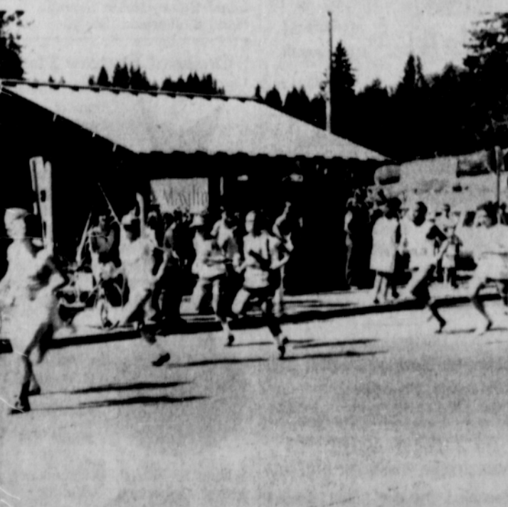
THE FIRST Annual Marathon was off to a flying start as 16 boys, men and one lone girl competed in the 9.6 mile race. All entrants finished.