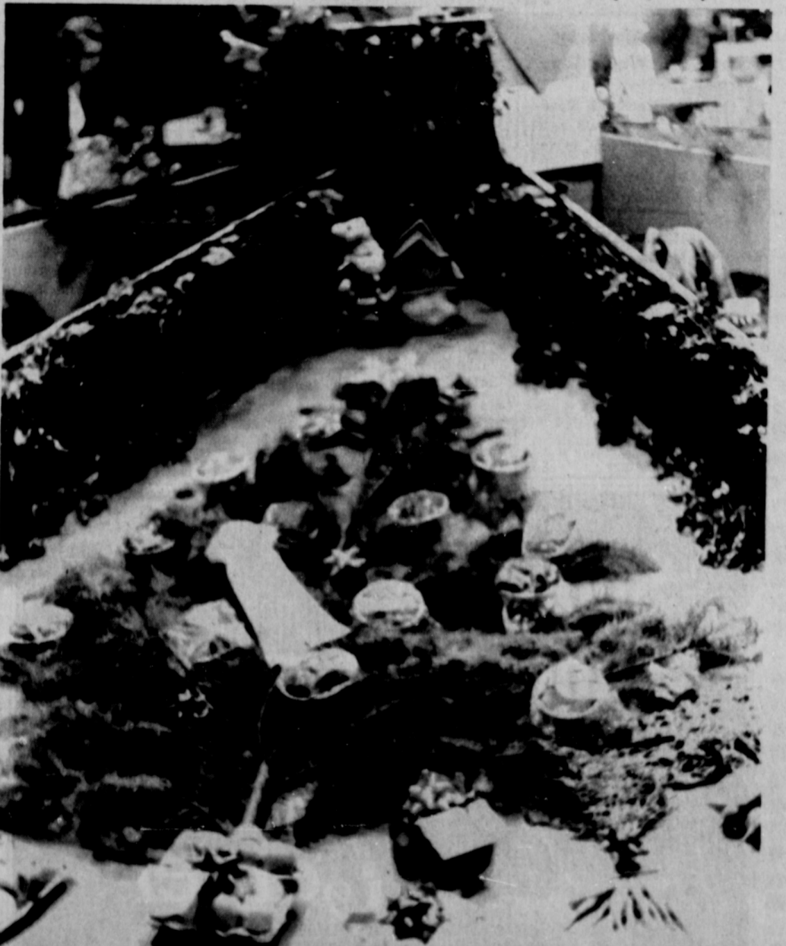
THIRD PLACE in Grange booth competition for their display which featured a winter theme, at Columbia County Fair went to Natal Grange

The council's next regularly scheduled meeting will be August 6, at 8 p.m., at City Hall.