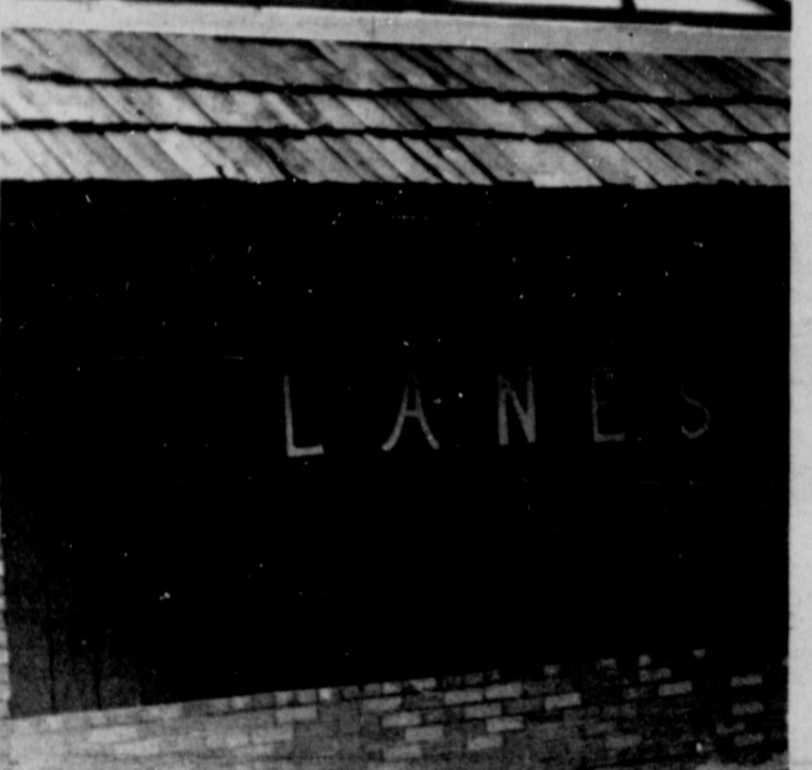
MORE SPRUCING UP is in evidence along Bridge Street this week. Lew's Place is boasting a new look on front of building, Alpine Lanes a new sign and Alpine-style front, and Bill Horn's office is sporting a new coat of paint.