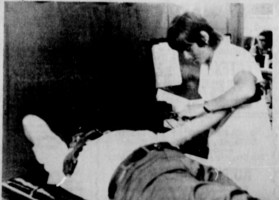
IN ADDITION to donating his time and services to the Red Cross Bloodmobile's visit in Vernonia,