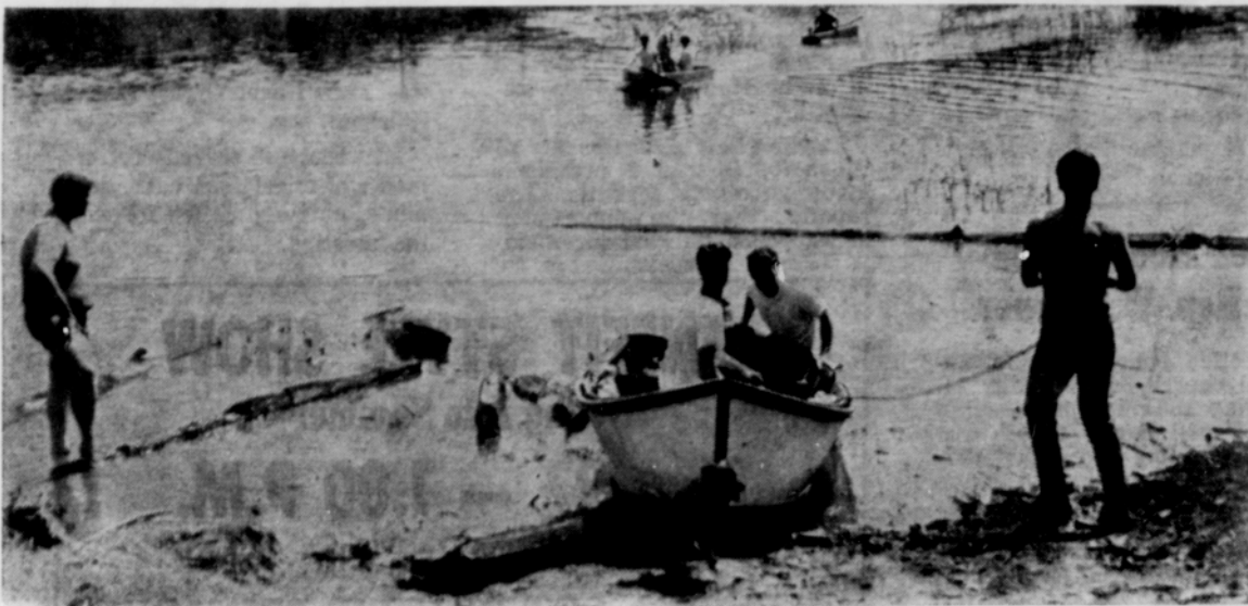
THE SECOND "go around" at Lake Vernonia was held the past week by the male members of the VHS senior class and Paul Bunyan club. Lots of debris was wrestled from the lake by the group.

COMPILED BY THE VERNONIA HIGH SCHOOL JOURNALISM CLASS