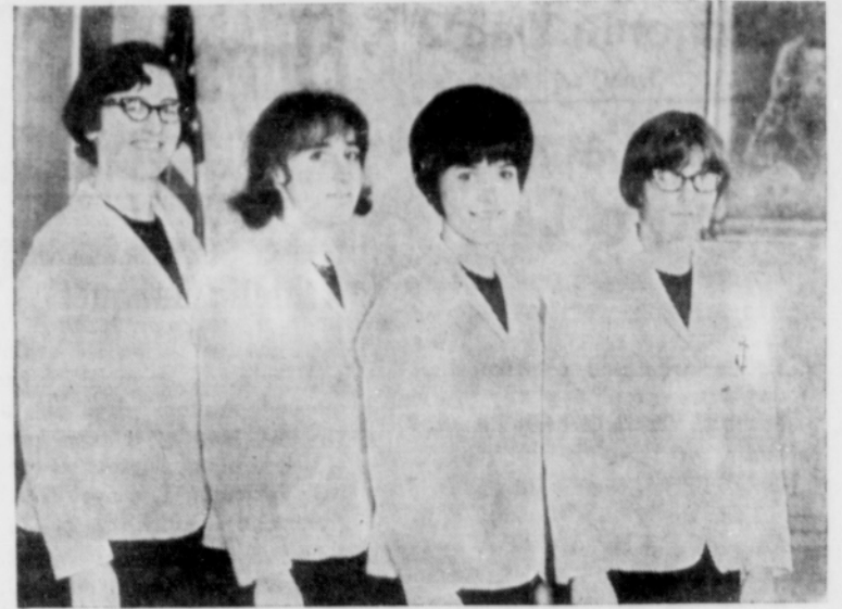
THE ANCHORETTES, a girls' trio, with their accompanist, will be at the First Christian church here Sunday evening, April 21, at 7:30 p.m. They are from the Puget Sound College of Bible at Seattle. The group will also participate in the 6:30 p.m. youth service.

Other racks in business places around town hold folders of interest to tourists.