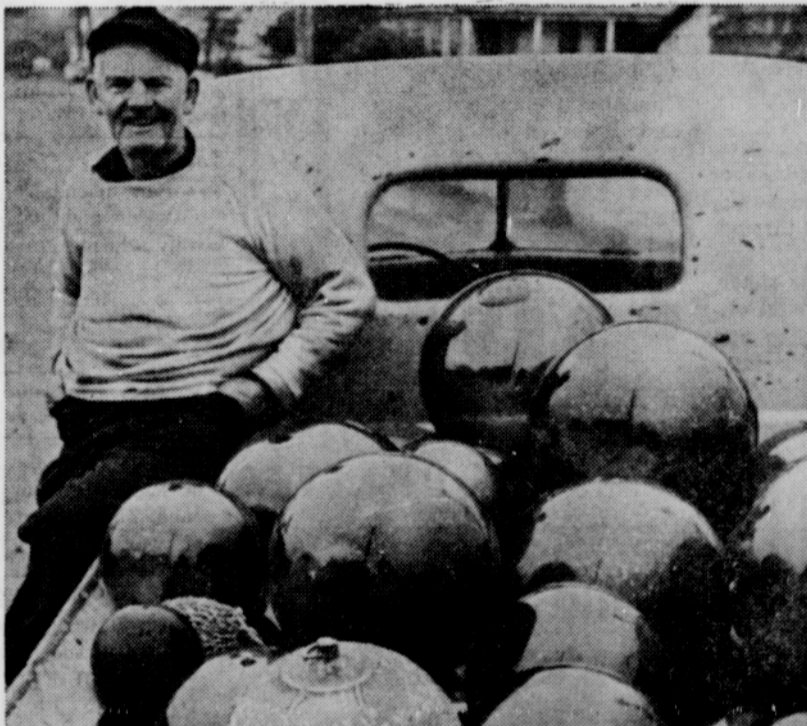
A Beachcomber's Strike — Glass Balls From The Sea

on the Long Beach Peninsula For 100 Years Oregon's Favorite Ocean Playground!