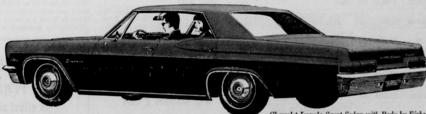
Chevrolet Impala Sport Sedan with Body by Fisher