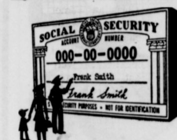
By Woodrow Moe