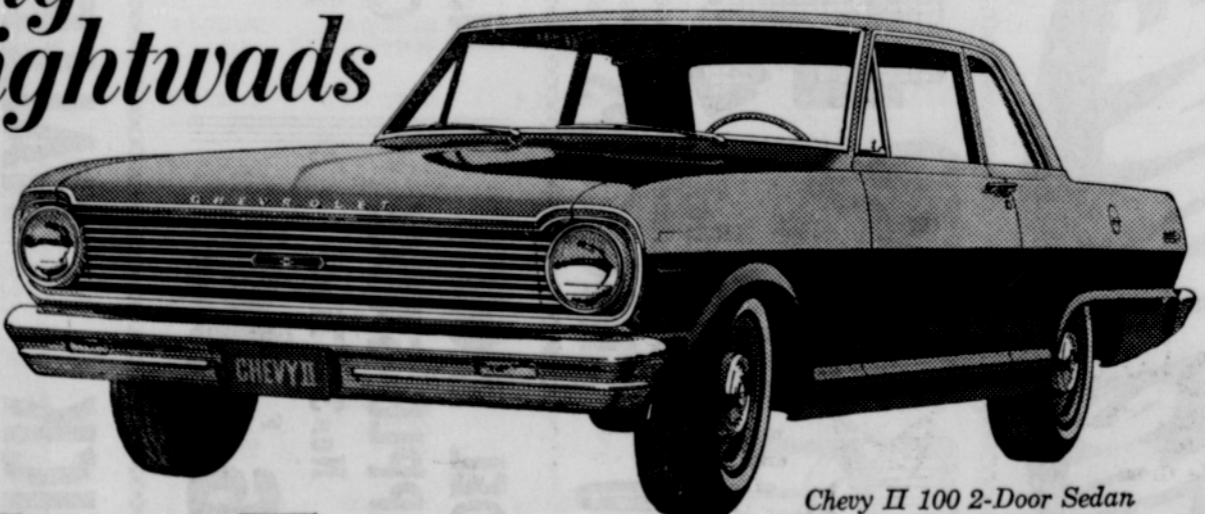
Chevy II 100 2-Door Sedan