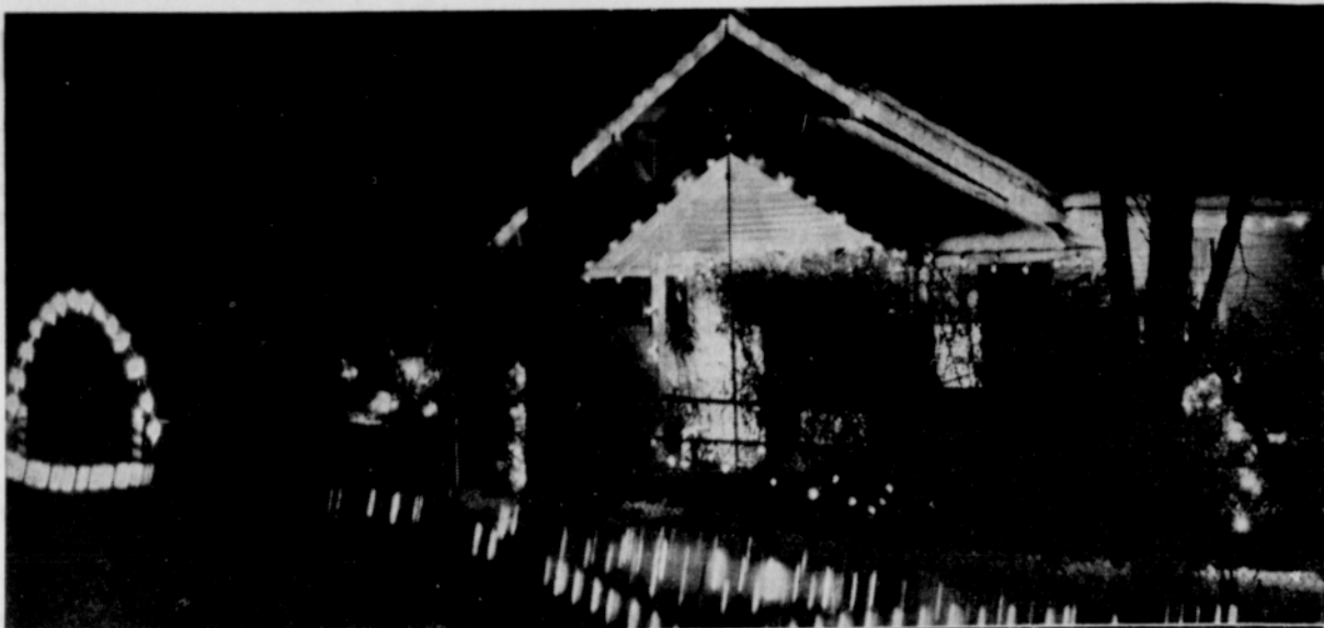
ENTIRE front of Joe Grosche home was lighted as well as yard at right which displayed a nativity scene. Nativity scene was complete with star in tree above. The light arrangement was first place in the religious category.