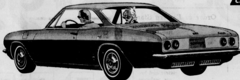
New Corvair Corsa Sport Coupe

road. And even that'll seem newer. Because now Chevrolet's Jet-smooth ride is smoother than ever. And we're itching to show it off.