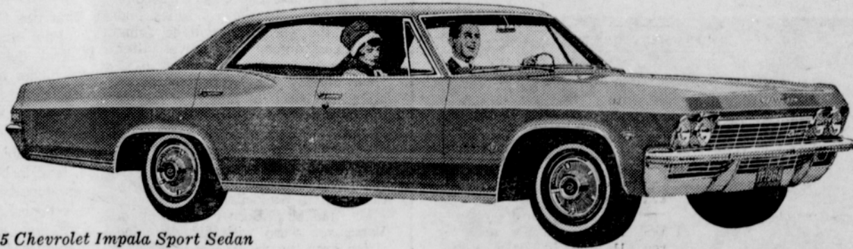
'65 Chevrolet Impala Sport Sedan