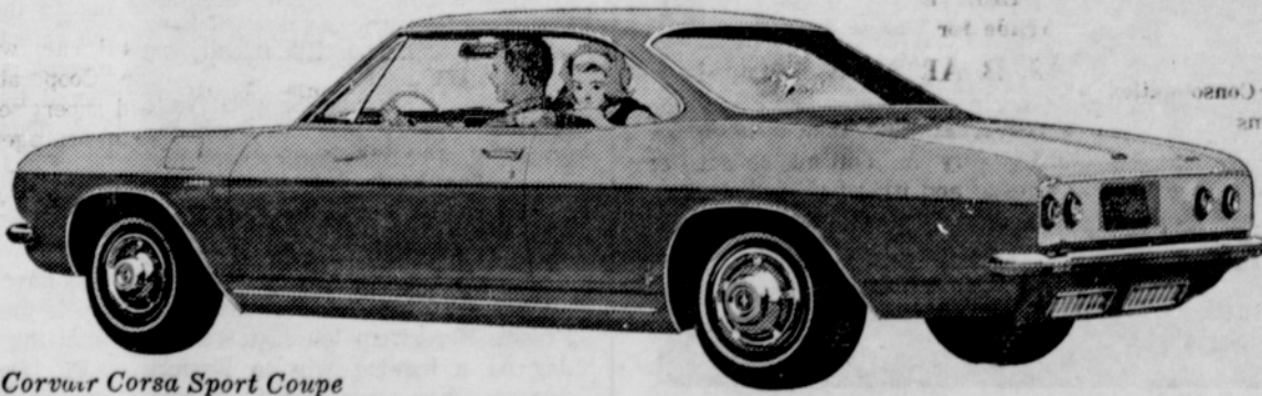
New Corvair Corsa Sport Coupe

It's '65's biggest, most beautiful change. There's striking new styling. New length, width and lowness. A roomier new Body by Fisher housing an interior that's a knockout. And a more serene Jet-smooth ride with a new Full Coil suspension system. Fact is if you overlook just one thing you can easily convince yourself you're onto a big expensive car here. And that thing is its Chevrolet price.