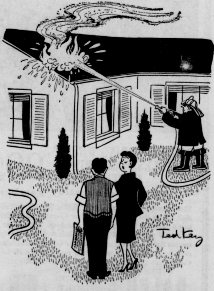
National Board of Fire Underwriters

The next meeting of the society will be held at the fairgrounds on Wednesday, October 21.