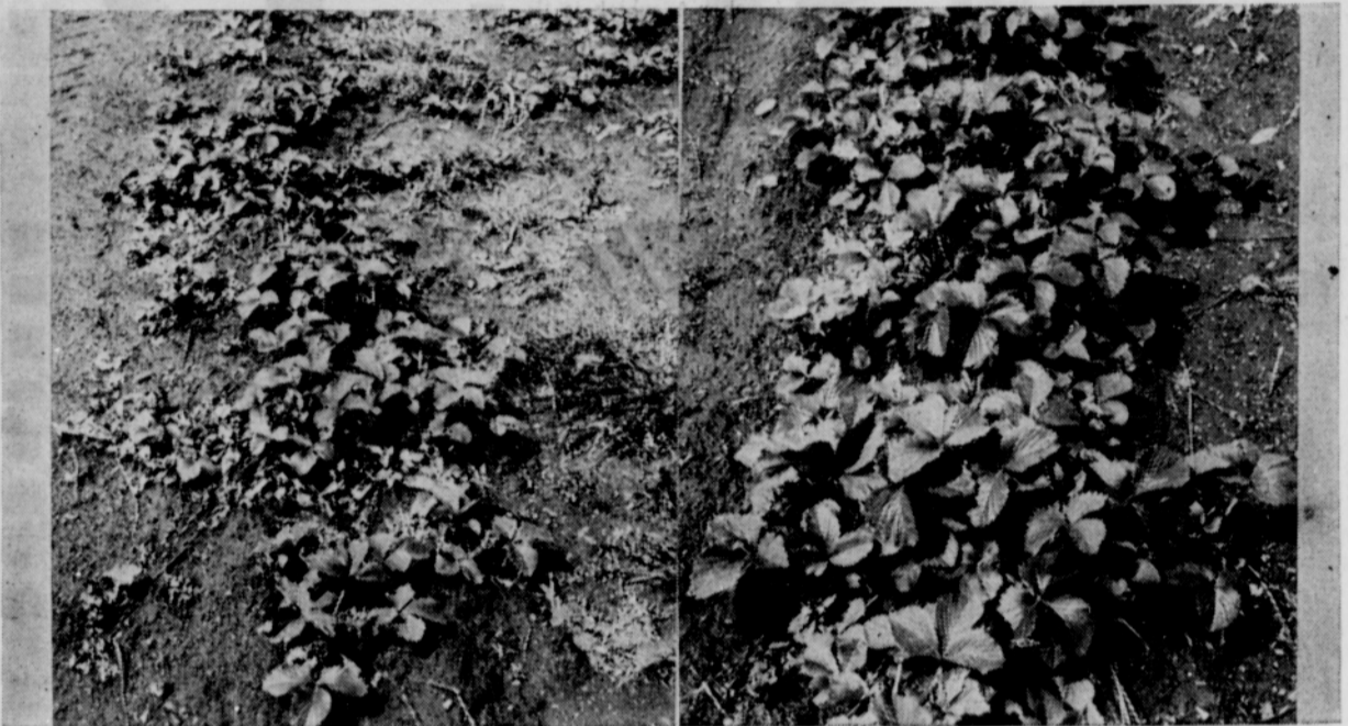
Strawberry plants in these two photos were taken from the same field, but soil for plants at left was not fumig- ated while soil for plants at right was fumigated.