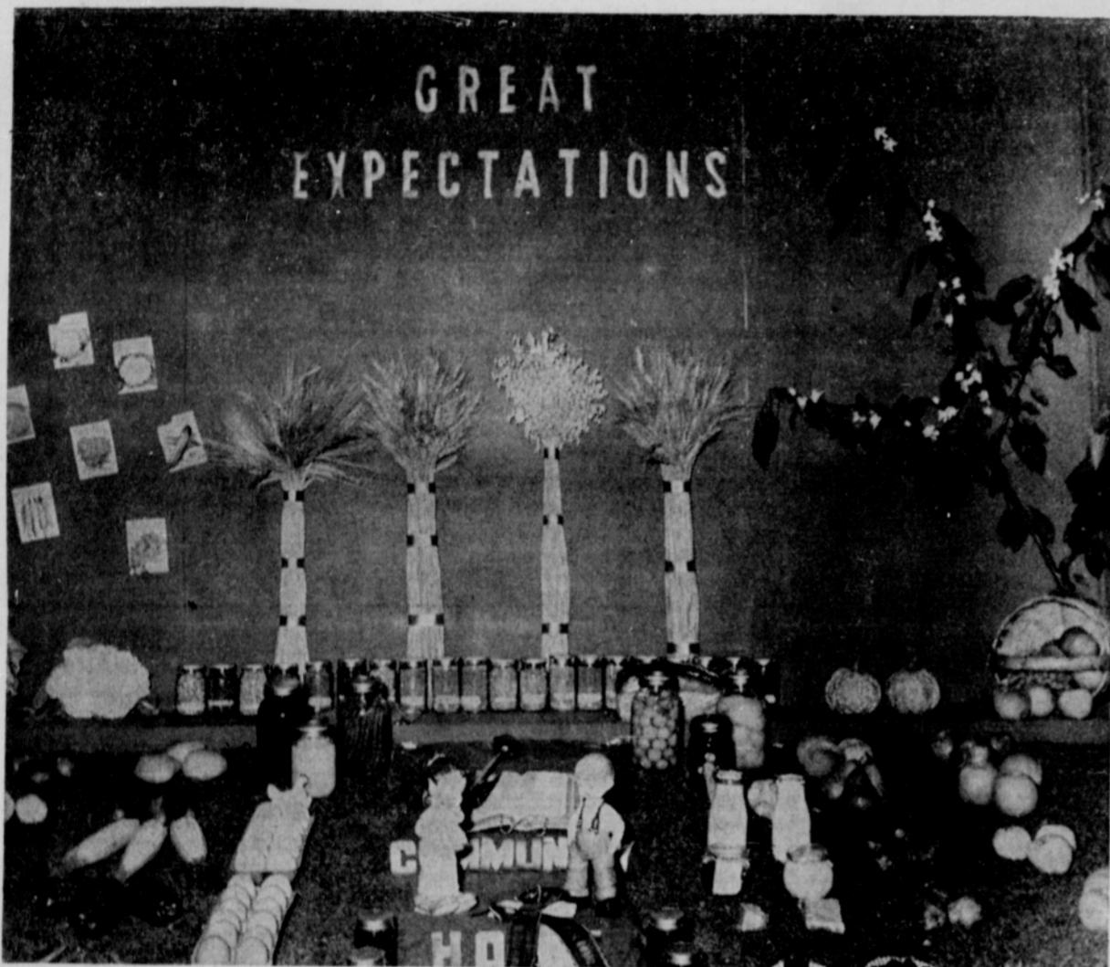
A SPECIAL award went to the Warren Grange entry "Great Expectations" which featured a background of four golden sheafs of grain, the American flag and the

flags on the right. A small logging truck with a huge log, canned displays of meats, fruits and vegetables stairstepping up the sides of the booth and general farm produce and flowers completed the display.