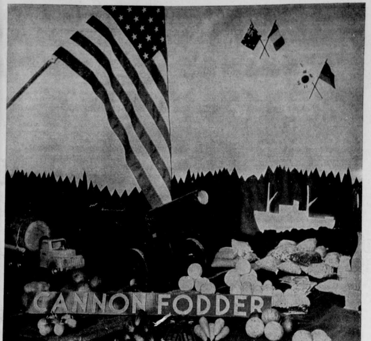
THE SOUTH Scappoose Grange booth entry which won a second place award at the county fair last week had a theme of "Cannon Fodder". The booth featured a miniature cannon in the center of the display with a large American flag in the left background and smaller

elve figurines were depicted mining, fishing, picking berries, gardening, etc. The booth also carried displays of general farm produce.