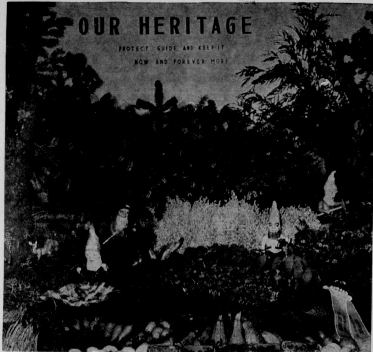
THE NATAL Grange booth entry won a fifth place ribbon with a mountain theme. The background featured a painted mountain range flanked by trees, while

elve figurines were depicted mining, fishing, picking berries, gardening, etc. The booth also carried displays of general farm produce.