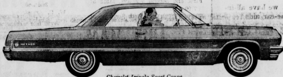
Chevrolet Impala Sport Coupe