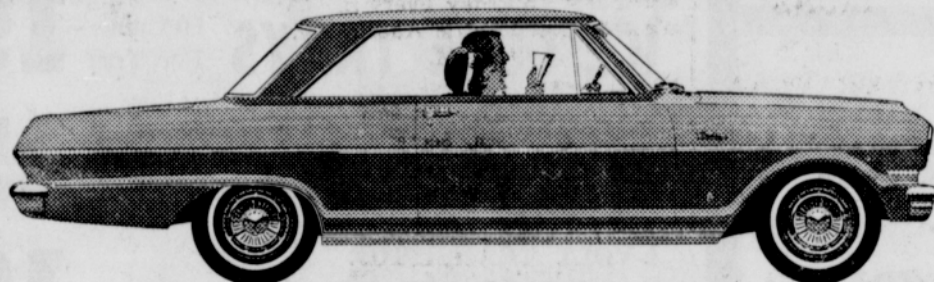
Chevy II Nova Sport Coupe