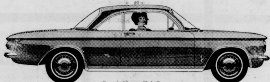
Corvair Monza Club Coupe