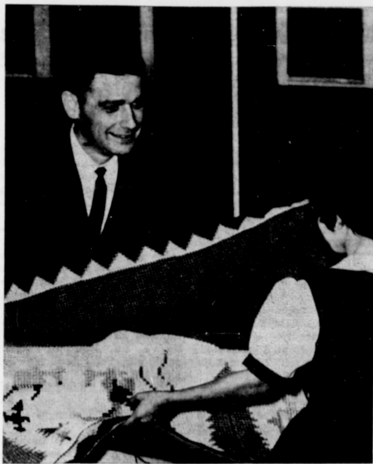
SMALL PATIENT at Morningside hospital, Portland, presents Mark Hatfield with hand-made hooked rug. During the Governor's tour of the 350-bed psychiatric facility, hospital officials announced that Morningside would begin accepting private patients from Oregon and neighboring states. For the past 50 years, Morningside has been primarily occupied by patients from Alaska.