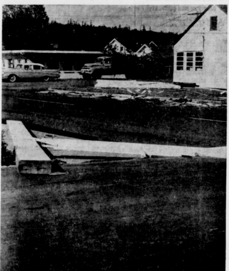
IN FOREGROUND is part of high school carport from east end of building where wind dropped it over hedge and sidewalk in front. Remainder of roof sailed across street into front yard of H. H. Sturdevant home where it struck foundation of house, causing some damage.