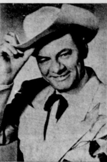
T. TEXAS TYLER