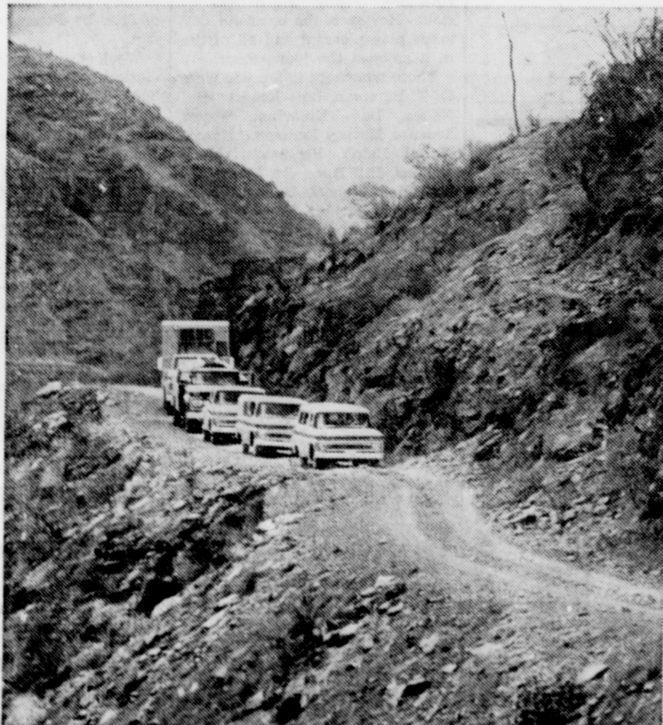
Sometimes the caravan crept along for hours in low gear. It took 17 days to go 1,066 miles! This is the road near Loreto.

...THE ONES THAT WHIPPED THE BAJA RUN...TOUGHEST UNDER THE SUN... TO SHOW THE WORTH OF NEW ENGINES, FRAMES AND SUSPENSIONS!