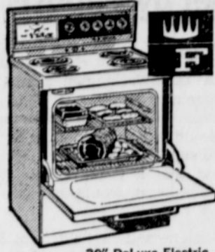
30" DeLuxe Electric Model RD-38-62

Speed-Heat surface unit. Automatic Cook-Master can start and stop oven—Unlimited heat settings from simmer to high! Frigidaire dependability $249.95 too!—Only