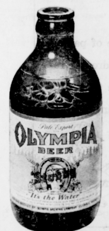
OLYMPIA BREWING CO., Olympia, Wash. *Oly ** 13-62