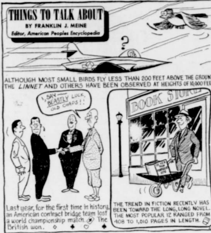
ALTHOUGH MOST SMALL BIRDS FLY LESS THAN 200 FEET ABOVE THE GROUND, THE LINNET AND OTHERS HAVE BEEN OBSERVED AT HEIGHTS OF 10,000 FEET.

WEDNESDAY, JUNE 20 Nehalem Chapter No. 153, OES—Masonic Temple, 8:00 p.m. Father's night and birthday observance. Boy Scouts troop 201 — City park cabin, 7:00 p.m.