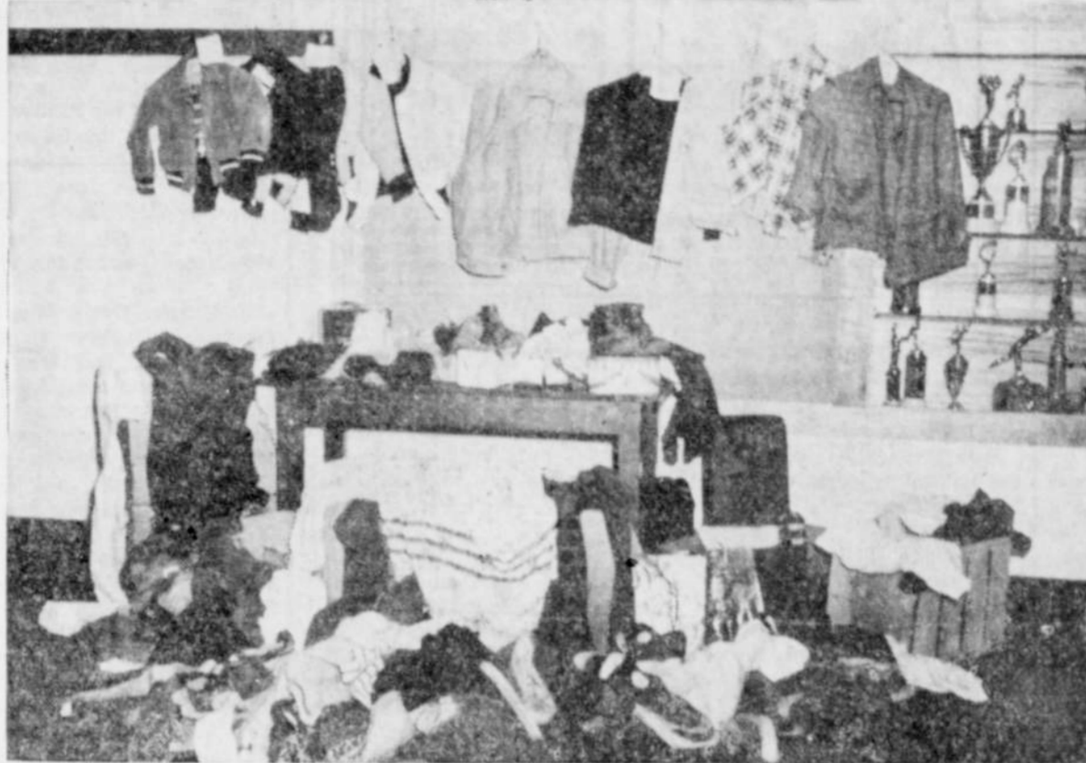
ABOVE is shown one of the problems of a school administrator when school is out and the pupils and teachers have gone their way for the summer vacation. Almost immediately the custodial staff begins the job of cleaning and repairing for the fall term. Included in the clean up is the assortment of clothes, gloves, shoes, lunch pails, sports equipment, etc., that students have left behind. This year's collection is pictured above and needs to be disposed of. In the hope that some of the property may be claimed, the school will be open Monday and Tuesday of next week for claiming purposes.

FLAG DAY , celebrated annually on June 14, is the anniversary of the day on which the Continental Congress, meeting in Philadelphia, adopted the stars and stripes as the national flag of the United States in 1777. At the request of General Washington, the first flag was made by Betsy Ross of Philadelphia. Now, each year a service is held on June 14 in the Betsy Ross house and the Patriotic Order of Sons of America places a wreath on her grave.