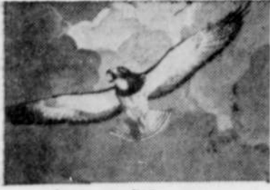
SWAINSON'S HAWK

The Swainson's Hawk breeds from the interior of British Columbia through Fort Yukon and Great Slave Lake country to Manitoba and south to northern Mexico. Obviously it is primarily a western species. It may be found as a casual visitor east to Quebec, Maine, New York and Florida so it is not necessarily a complete stranger anywhere in the United States. It normally winters in South America and even there is found in the winter season only casually north of the Equator.