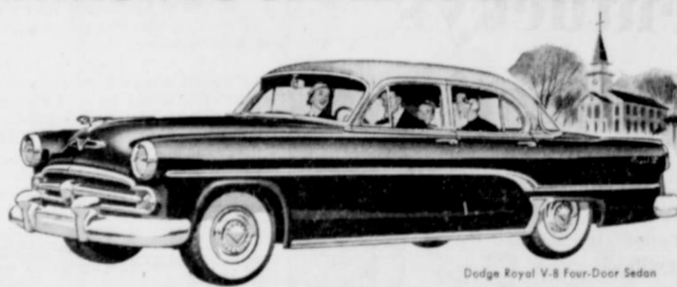
Dodge Royal V-8 Four-Door Sedan