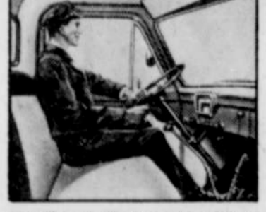
New "Divertized" cabs cut driver fatigue! New wider adjustable seat with counter-shock seat snubber! New one-piece curved windshield—55% bigger! Push-button door handles, rotor latches.

Now Ford offers a vastly expanded line of over 190 completely new truck models! Ranging from Pickups to 55,000-lb. G.C.W. Big Jobs! New cabs, new transmissions, new chassis, new power... New time-saving features throughout all Ford Trucks to GET JOBS DONE FAST!