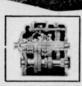
Synchro-Silent transmissions now standard in all Ford Truck models—at no extra cost! Over-drive or Fordomatic Drive available in half-tonners (extra cost!)