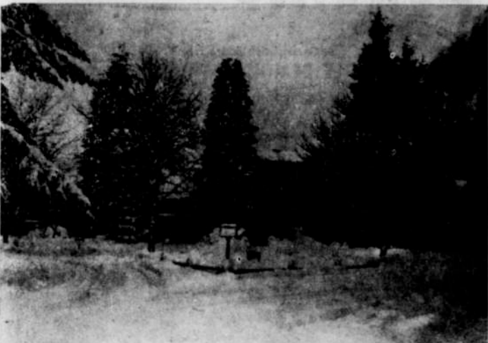
THE CAR above was one of many left outside late last week to be almost covered with snow. Below is the triangle at the entrance to O-A residences.