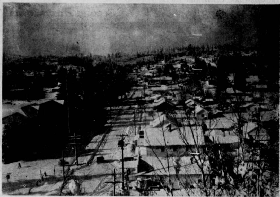
FROM THE O-A hill Vernonia presented this snow scene Saturday to those who thought to look. Part of the day was clear and very appropriate for photo fans, many of whom have taken the opportunity to record in pictures the beautiful winter scenes. The mantle of white reached a depth here that exceeds any recorded for many years.