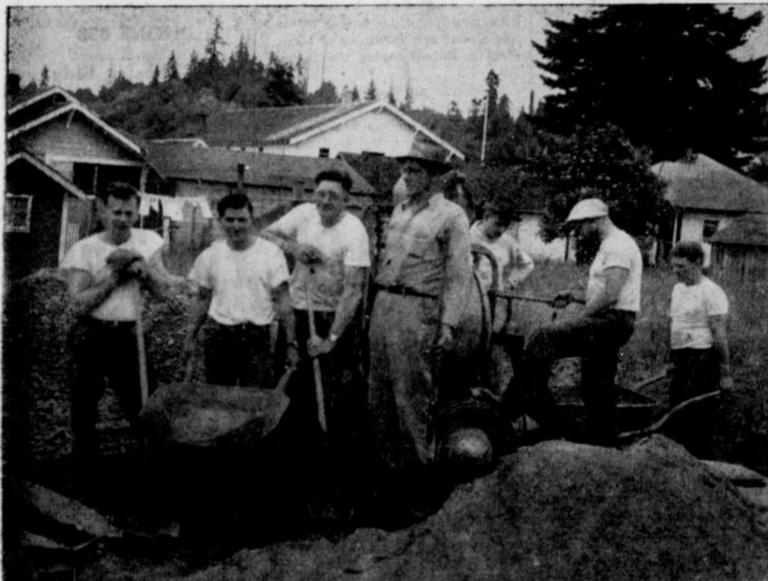
THE POURING OF CEMENT for the VFW building was accomplished to mark the initial step towards construction of the hall for Brown-Gibson and the Auxiliary. The building which is now partially completed is of brick building block.