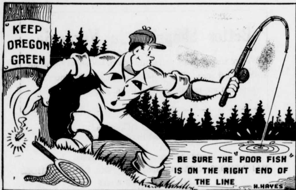
Sponsored by the Keep Oregon Green Committee