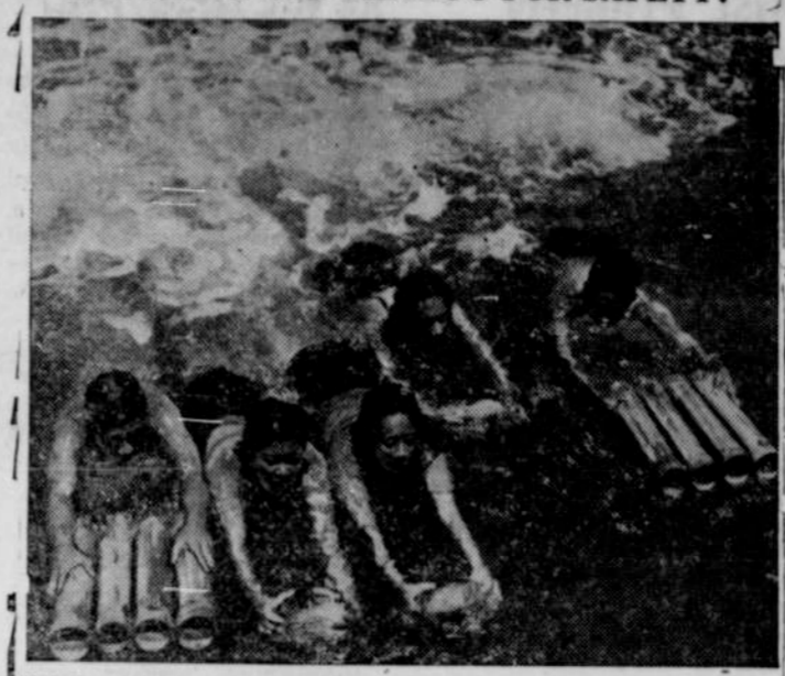
KICK-BOARDS AND FLOATS made from bamboo and coconuts are used by these young swimmers in the Gulf of Panay, Philippine Islands. With the assistance of the American Red Cross, the first national Water Safety school outside of continental United States is under way in the Philippines this year.