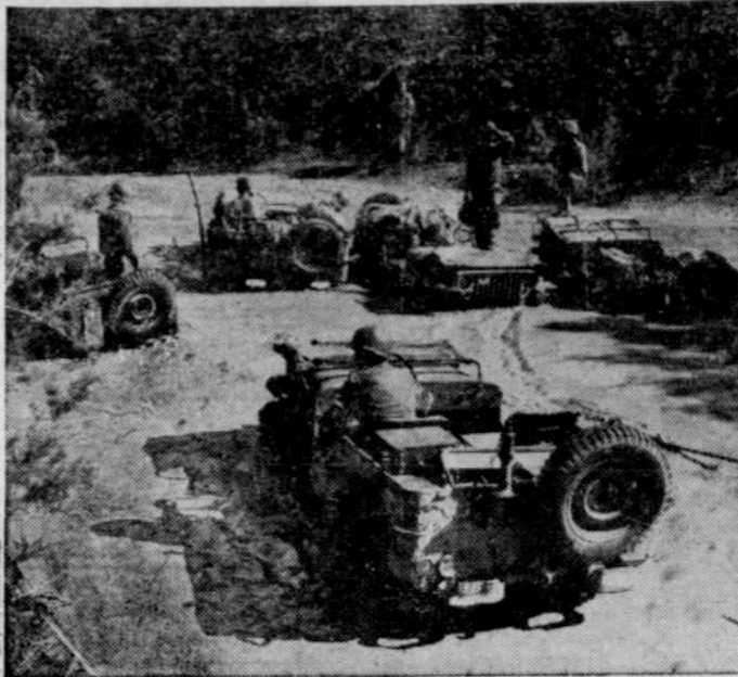
Fifth Army jeeps crossing rain-swollen stream in the Volterra sector, in Italy. A few moments before the rain this stream was only a few inches deep.