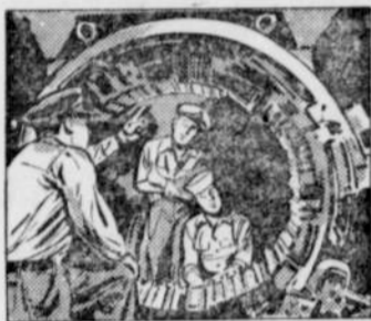
3. . . . . and go out into the shops where they watch workmen construct the same kind of electric equipment that will some day be put in their charge.