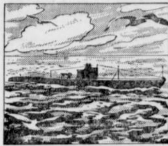
1. Electricity is vital to the running of every submarine. It does an amazing variety of important jobs, from turning the propeller to cooking the coffee.

Just one evidence of the cooperation between the armed services and our vast industrial army—a school for submarine electricians conducted at one General Electric factory.