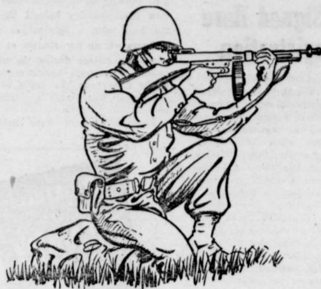
HOT WORK AT SHORT RANGE —The Thompson ("Tommy") sub-machine gun in the hands of a trained infantryman offers a formidable combination which can spell the difference in fire-power when American troops clash with those of the enemy.