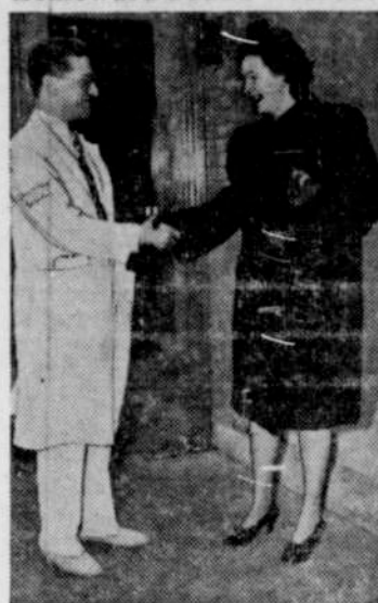
After treatment in tuberculosis hospital patient leaves for home, a healthy person again.