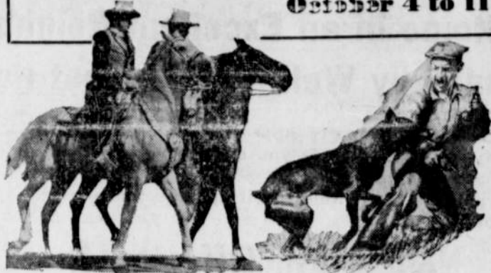
Above illustration shows members of San Francisco Mounted Posse also "Canine Police" going through paces.