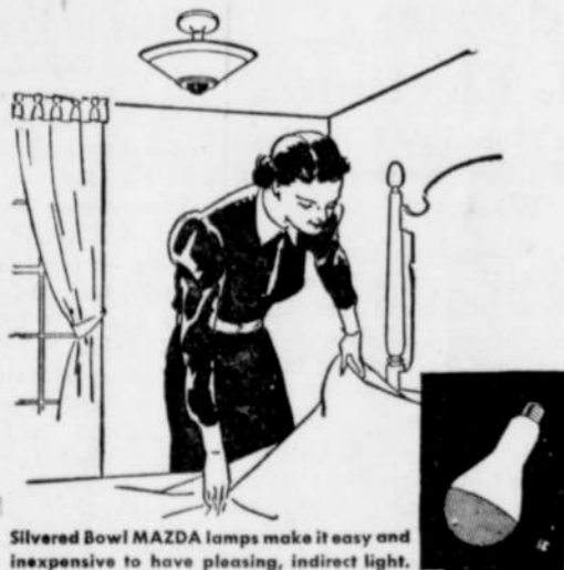
Silvered Bowl MAZDA lamps make it easy and inexpensive to have pleasing, indirect light.