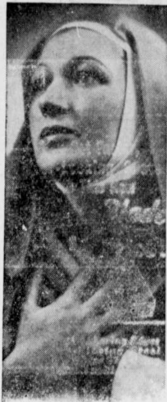
"Mary the Mother"

The story of the Luenen Passion Play of the Black Hills, to be presented at the Portland Civic Auditorium for four matinee and evening performances beginning Tuesday, January 30, is as interesting as the presentation itself.