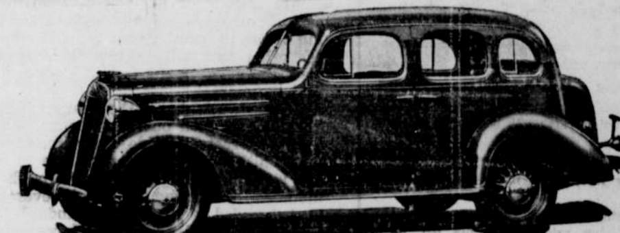
'36 CHEVROLET 4-DOOR SEDAN— with built-in trunk; mechanically okeh. Its original gleaming black duco finish hasn't a scratch on it. Real good tires. Special ..... $425