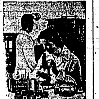
Medical research in tuberculosis is one of the most valuable activities made possible by Christmas Seal income. Research is carried on throughout the year at six universities in this country.