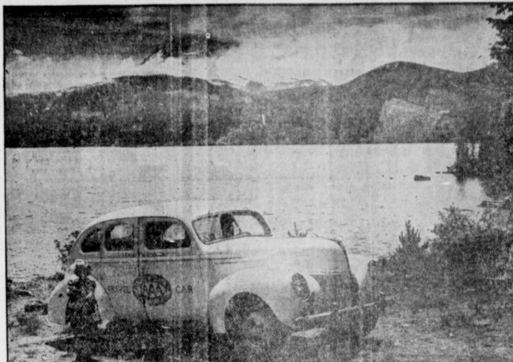
Mount Jefferson rises behind Olallie lake, where the motorlog cruise car stopped for a short rest. The lake was one of the many the motorlog car passed during its tour.

This newspaper is co-operating with the Oregon State Motor association and The Oregonian in presenting a series of motorlogs designed to stimulate travel in Oregon and the Pacific northwest. This article was condensed from a full-page article appearing in The Oregonian August 20.