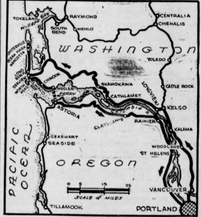
The route down the North Bank highway to the peninsula and back up the south side is mapped here.

The return route from Astoria was eastward up the Columbia over the paved Lower Columbia River highway, a distance of 105 miles.