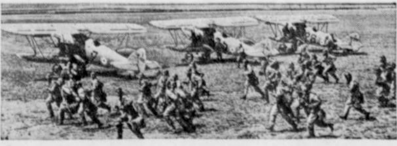
Post haste, British pilots see how fast they can take off.