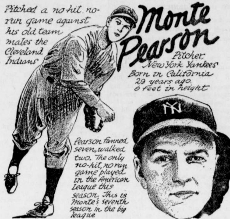
Monte Pearson Pitcher New York Yankees Born in California 29 years ago, 6 feet 2 1/2 height Pearson fanned seven, walked two. The only no-hit, no-run game played in the American League this season. This is Monte's seventh season in the big league

Pitched a no-hit, no-run game against his old team mates the Cleveland Indians