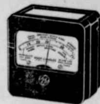
Here is the new scientific instrument—the Light Meter—that enables us to measure lighting just as accurately as a thermometer measures temperature.