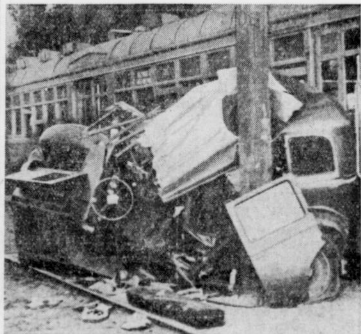
Max E. Sparberg of Los Angeles is lucky to be alive. Above is shown the demolished remains of Sparberg's car after he dropped a decision to a trolley car. Sparberg escaped with a number of abrasions.