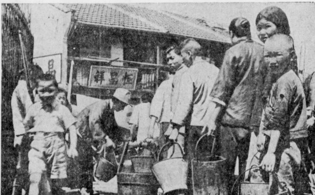
Carrying buckets, pitchers and jugs, crowds of Chinese refugees line up at a water tap in Shanghai and wait their turn for the precious fluid. This is one of the few sources of meager water supply in beleaguered Shanghai.