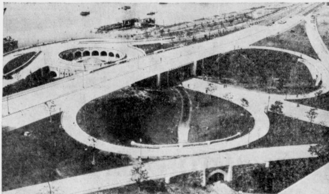
An elevation view of the traffic circle and fountain at Seventy-ninth street, New York city, showing part of the superhighway that is a big feature of the $24,000,000 improvement project on Manhattan's west side waterfront. Beneath this traffic circle is a garage accommodating 250 cars.