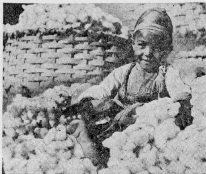
"Cotton's looking pretty good," was the encouraging report of the supervisor of the 2,000-acre Roosevelt farm near Warm Springs, Ga., when pickers began gathering the President's cotton crop recently. They're all busy but this fellow who finds relaxation on a pile of lint while other members of his family do the work. The President will probably get after him.