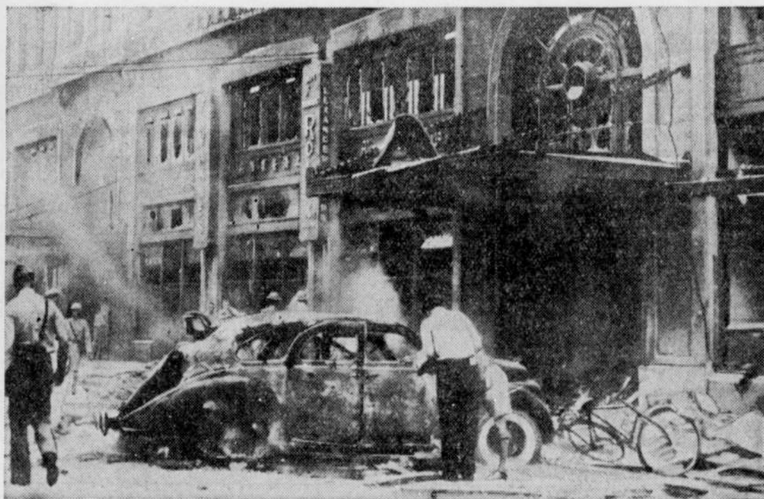
View of the international section of Shanghai after bombing from the sky by Chinese planes. Ruins of the Cathay hotel are seen, as fires sweep over the bombed area. With bombardments from Japanese warships in the Whangpoo river, untold damage was caused in the native sections of the city.