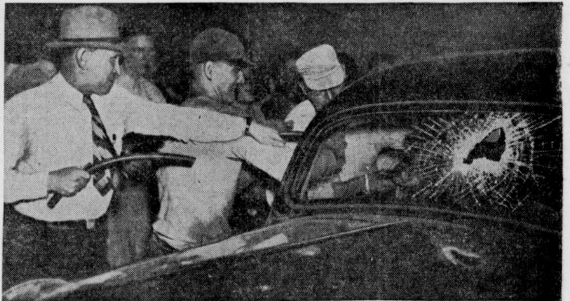
More than 100 persons were injured and one man was killed in rioting which flared up at a Cleveland plant of the Republic Steel company. Five hundred strikers and non-strikers are estimated to have taken part in the melee. Picture shows strikers breaking the glass of an automobile carrying non-strikers.