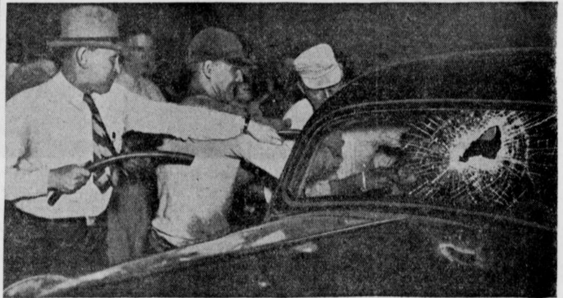
More than 100 persons were injured and one man was killed in rioting which flared up at a Cleveland plant of the Republic Steel company. Five hundred strikers and non-strikers are estimated to have taken part in the melee. Picture shows strikers breaking the glass of an automobile carrying non-strikers.