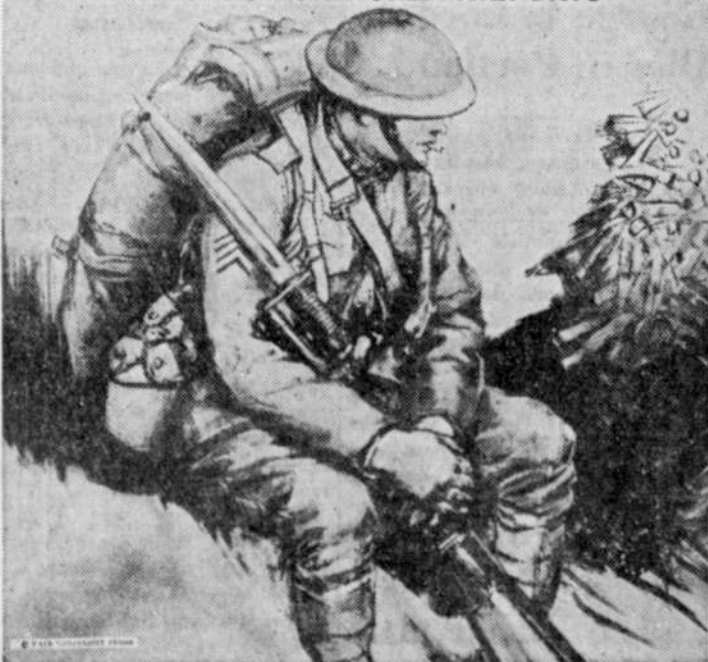
The American doughboy who fought "to make the world safe for democracy." The picture is from a drawing by Capt. Harry Townsend.